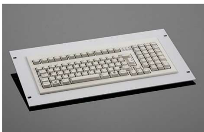
DS104W Built-in version

We offer this keyboard in different variants. Are you interested in any of the following solutions? Just get in touch with us.