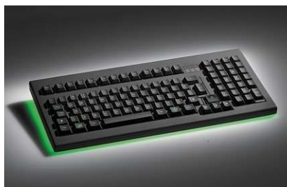
DS104W with Backlight